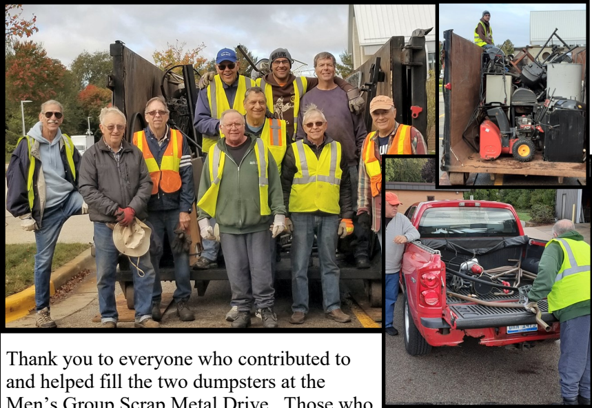
Thank you to everyone who contributed to and helped fill the two dumpsters at the Men’s Group Scrap Metal Drive. Those who brought metal and those that unloaded the metal, Thank You!