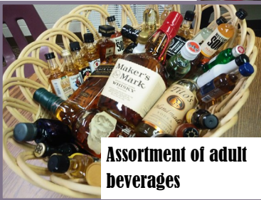
Assortment of adult beverages