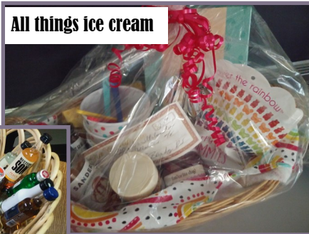
All things ice cream

This event takes a lot of people to make it run smoothly. Please see the sign-up sheets that are in the Gathering Area.