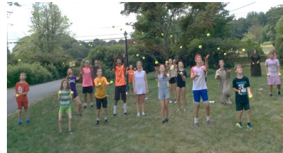
Summer Experiences for children

At 11am on Thursday, June 15 th , the Women's Guild will be meeting at Florentine's Located at 4261 Kalamazoo Ave. All women of the parish are invited to attend.